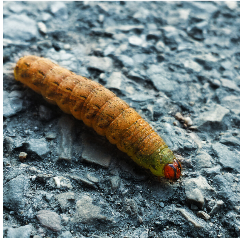
Creeping Locust (Cankerworm)