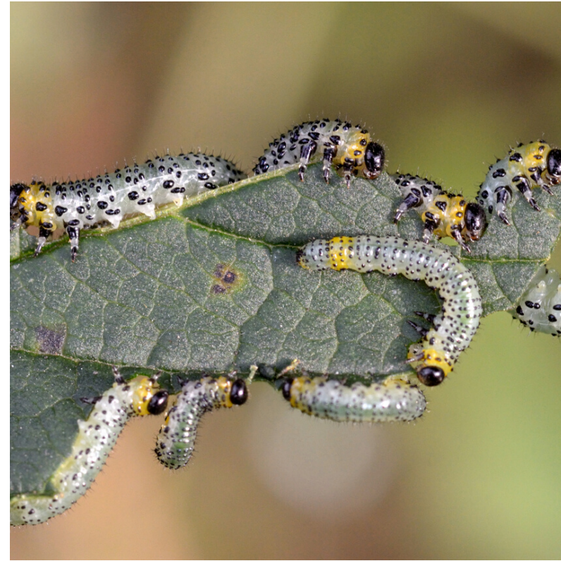
Gnawing Locusts (Caterpillar)