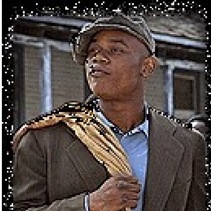
CAN'T GET RIGHT YEARS