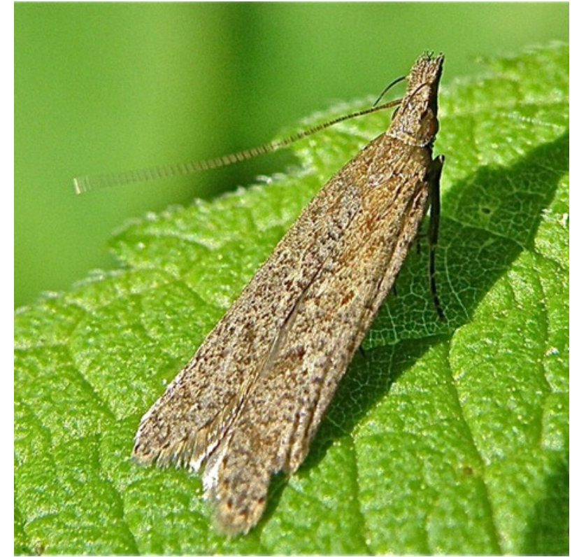
Stripping Locust (Palmerworm)